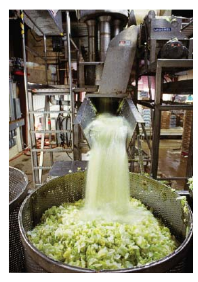
Leafty greens are washed three times in most processing plants.

There were even more significant changes in NSF processing plant procedures. In the fall of 2006, two "firewalls" were added to their food safety system – the first "test and hold" firewall applies to raw product as it enters the plant, the second after product is washed, bagged and ready to ship. NSF now tests all incoming loads of raw product for enterohaemorrhagic E. coli (including