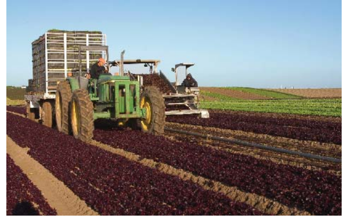
Harvest operations are another key focus of food safety.

For this reason, the timing and geographic patterns of recent produce-triggered outbreaks need to be carefully analyzed to see what products caused the outbreaks, how far the products had traveled, whether there were possible gaps in temperature control, and the frequency of illnesses per unit or produce purchased in a given region.