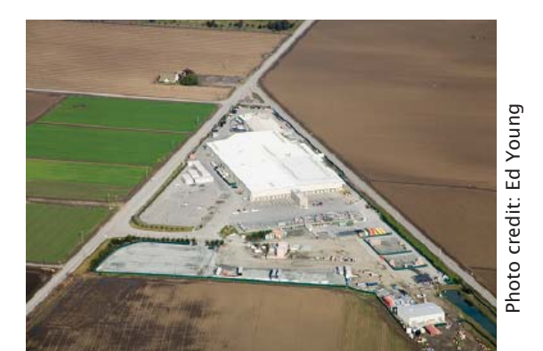
Natural Selection Foods processing plant in San Juan Bautiste, California.

• There was something unusual about the way the E. coli O157 was lodged on the leaf surfaces, because of the presence of a biofilm, or because the physical state of the leaves somewhere protected portions of leaf surfaces from the wash (e.g., leaves could have been folded, or stuck together).