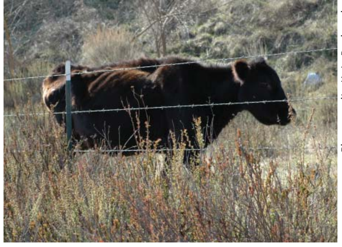
Cows under stress and in poor condition are more likely to shed E. coli O157. This cow was moving to a new pasture in January 2007 less than one mile from the outbreak field on the

Fortunately, wild and farm animals and crop farming have co-existed, side-by-side, for centuries, delivering enormous benefits to the soil, environment, and all animals, including humans.