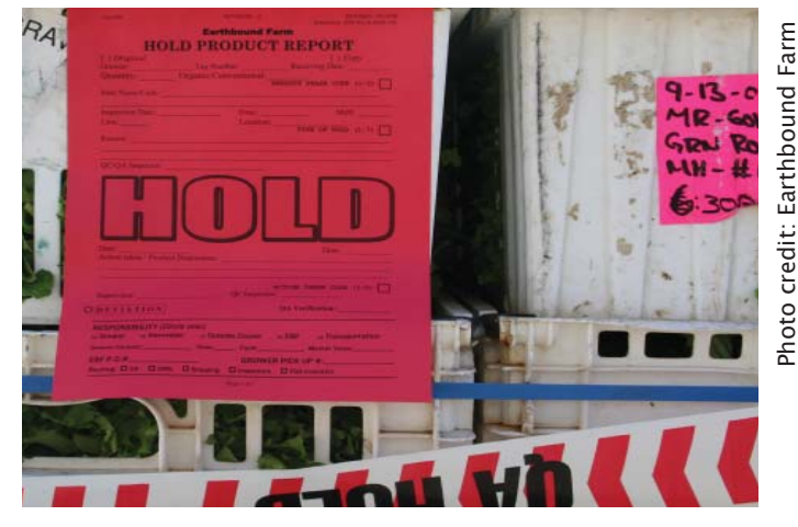
The testing of raw product for pathogens before entering the processing stream can help prevent future outbreaks.

It is clear that some growers and processors are going to include added or different preventive measures in their food safety programs; the firewall testing program at NSF is an example. Some diversity in the strategies employed in 2007 to achieve food safety is inevitable and desirable, and should accelerate progress in understanding the best ways to expand margins of safety.