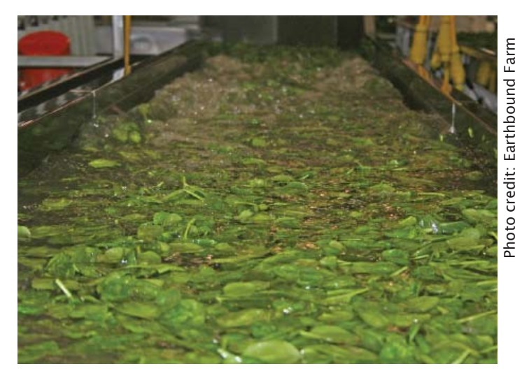
Leafy greens in the first wash cycle at the National Selection Foods, San Juan Bautiste plant.

More sensitive and specific test methods should be adopted. This step will help assure an outbreak-free 2007 season, and should also generate critical new knowledge needed to chip away at the 52,000 cases of human illness traced to E. coli O157 in recent years.