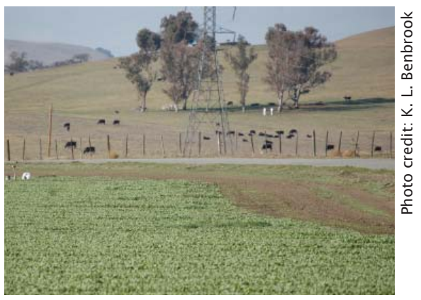
Cattle grazing in January 2007, in close proximity to the outbreak field on the Paicines Ranch.

The processing plant's washing procedures also clearly failed to eliminate the E. coli O157 bacteria that entered the plant on the contaminated spinach, nor did the plant's quality assurance procedures detect the O157 bacteria in finished product.