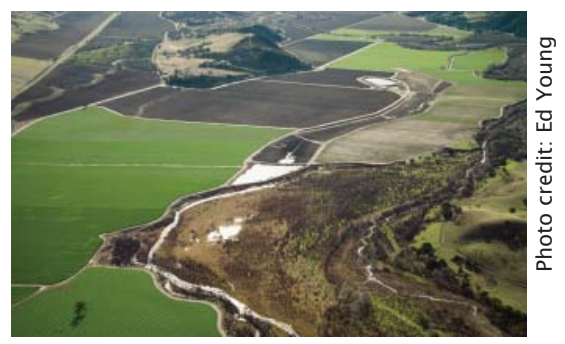
Wildland, cattle pastures, and intensively farmed vegetable fields co-exist throughout coastal California.

While there are few cattle in and around the heart of the Salinas Valley, grazing livestock operations are common all around the edges of the valley, throughout the hills dividing the Salinas Valley